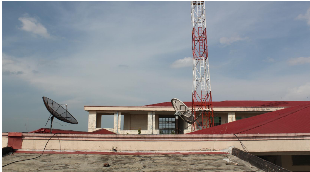
Satellite Dish Setup Environment

The following pictures depict the distance learning environment update at UCSY (Hlawgar Campus), Shwe Pyi Thar Township.