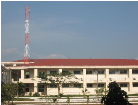
WiMax Tower at UCSY (Hlawgar Campus)

Wimax Connection between UCSY (Hlaing Campus) and UCSY (Hlawgar Campus) is set up by cooperating with JICA.