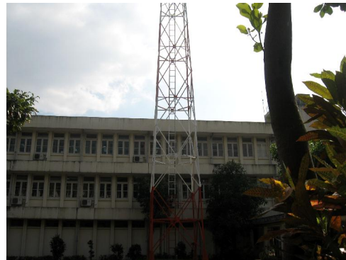
WiMax Tower at UCSY (Hlaing Campus)