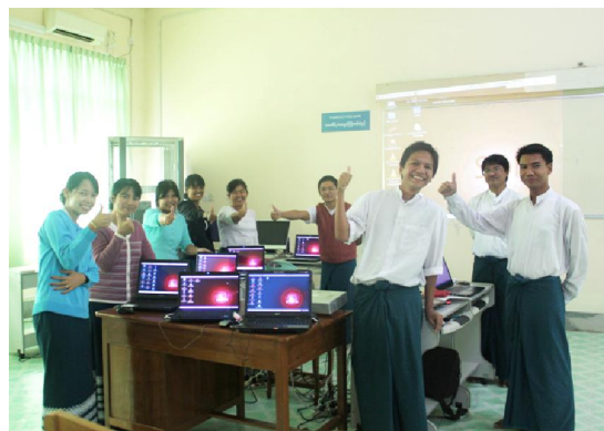
Class Room Environment